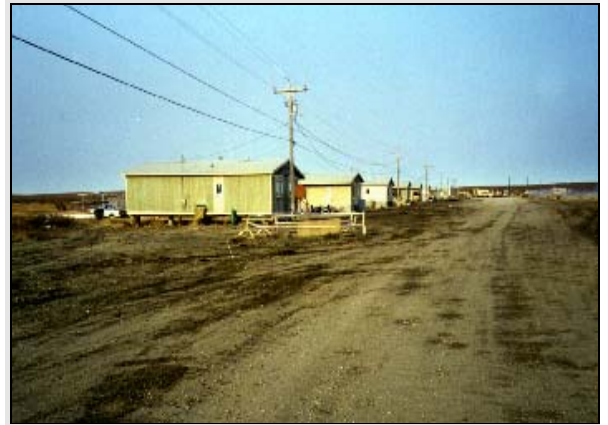
Deering Main Road

Rural community sewerage schemes Industrial developments Supply bases Housing developments / compounds Hazardous waste collection Airports & military installations Beach developments Remote villages