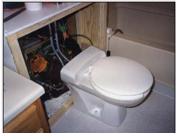
Toilet with Iseki Vacuum Valve in Sump

Cost effective solutions to many difficult drainage problems